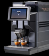
Magic B2 / B2+