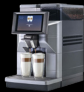
Magic M2 / M2+